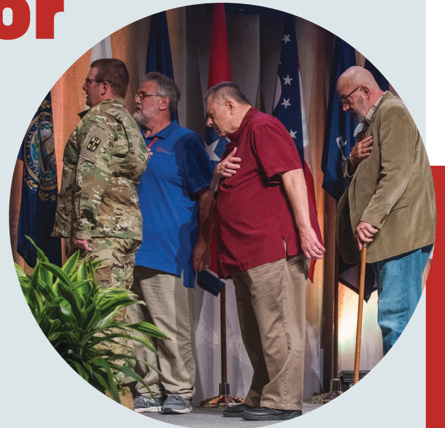
Delegates and their family members serving in the armed forces at our 2018 Convention.

These stories will help to honor members who serve our country and will be spotlighted in a future edition of Honor .